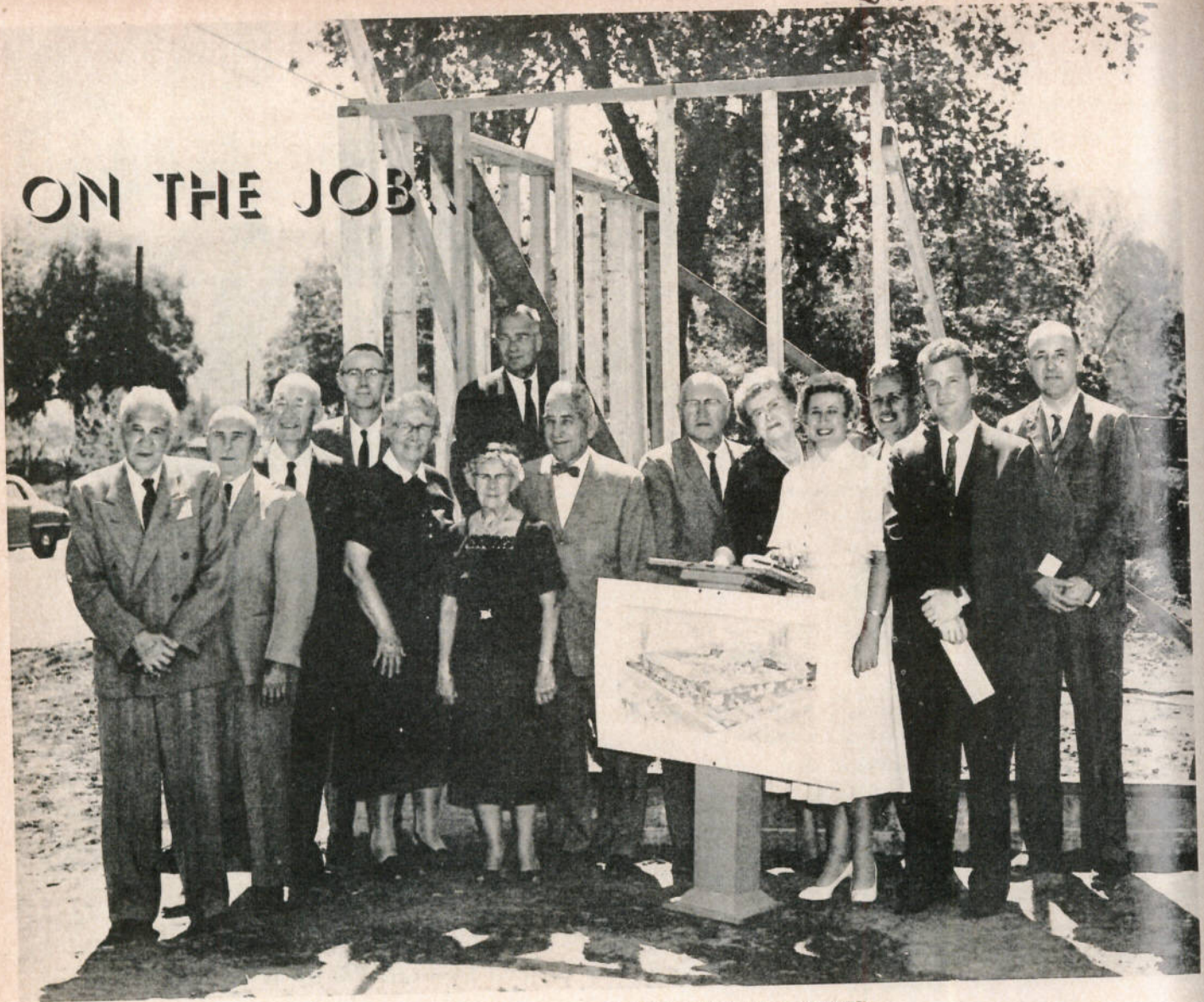
OFFICIALS AT THE CORNERSTONE LAYING